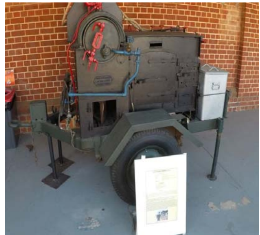
The Wiles Cooker ready for the 80th Anniversary celebrations for the Catering corps