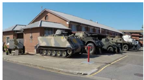
Outside vehicle display at the Army Museum at Keswick Barracks.