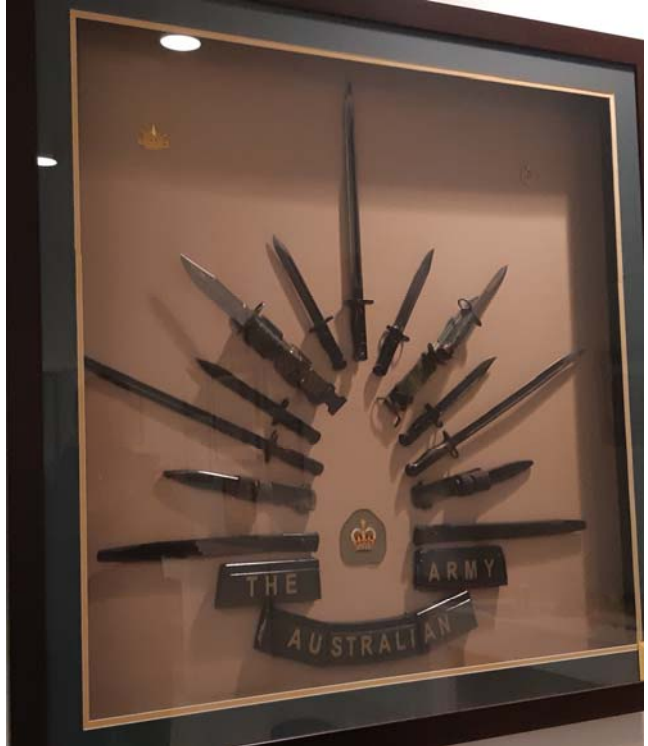
'Rising Sun' motif made out of Australian Army bayonets and SLR magazines, seen in the OR's boozer, Holsworthy Barracks

senses and made us think about how to perceive displays and layouts, and by extension, how to design them.