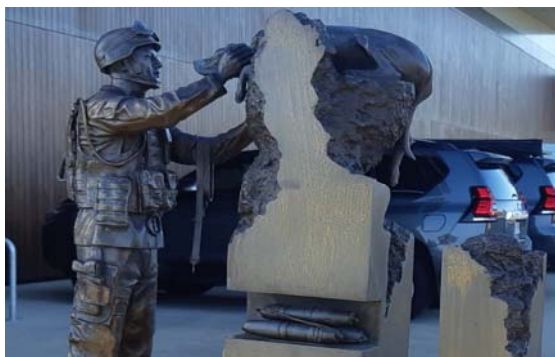
Sculpture in front of entrance to Australian Army Museum of Military Engineering (AAMME) at Holsworthy commemorating Explosive Detection Dogs and their handlers