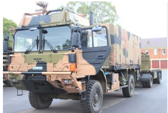
Transport Corps display at Keswick Barracks 17 June 2023