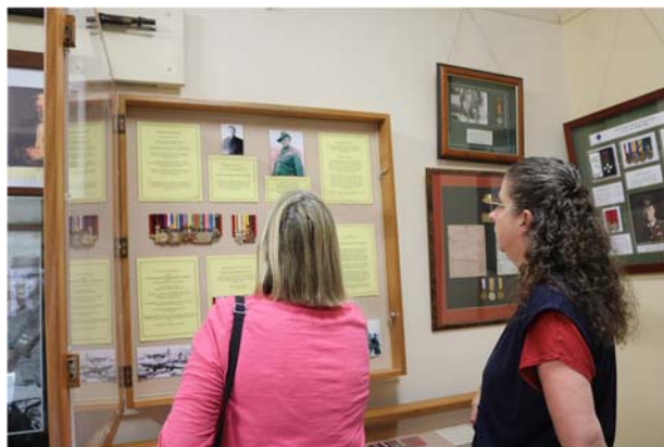
The Verrier story board in the Medal Room