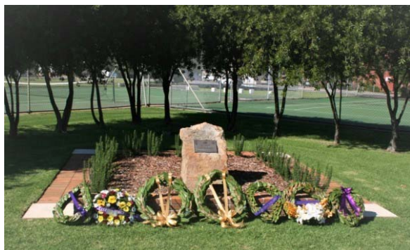
Anzac Day Dawn Service conducted on the Parade Ground at Keswick Barracks. Wreaths were laid under the Lone Pine.