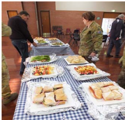
The great spread for morning tea

As it was their Birthday AAHU offered to pay for our morning tea on the day and the Keswick Cafe excelled themselves with a range of freshly prepared healthy sliders, fruit kebabs, mini baguettes, mini choc slices, mini pies, cakes, biscuits etc.