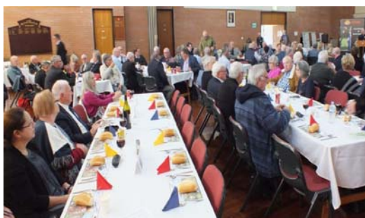
Guests attending the lunch.